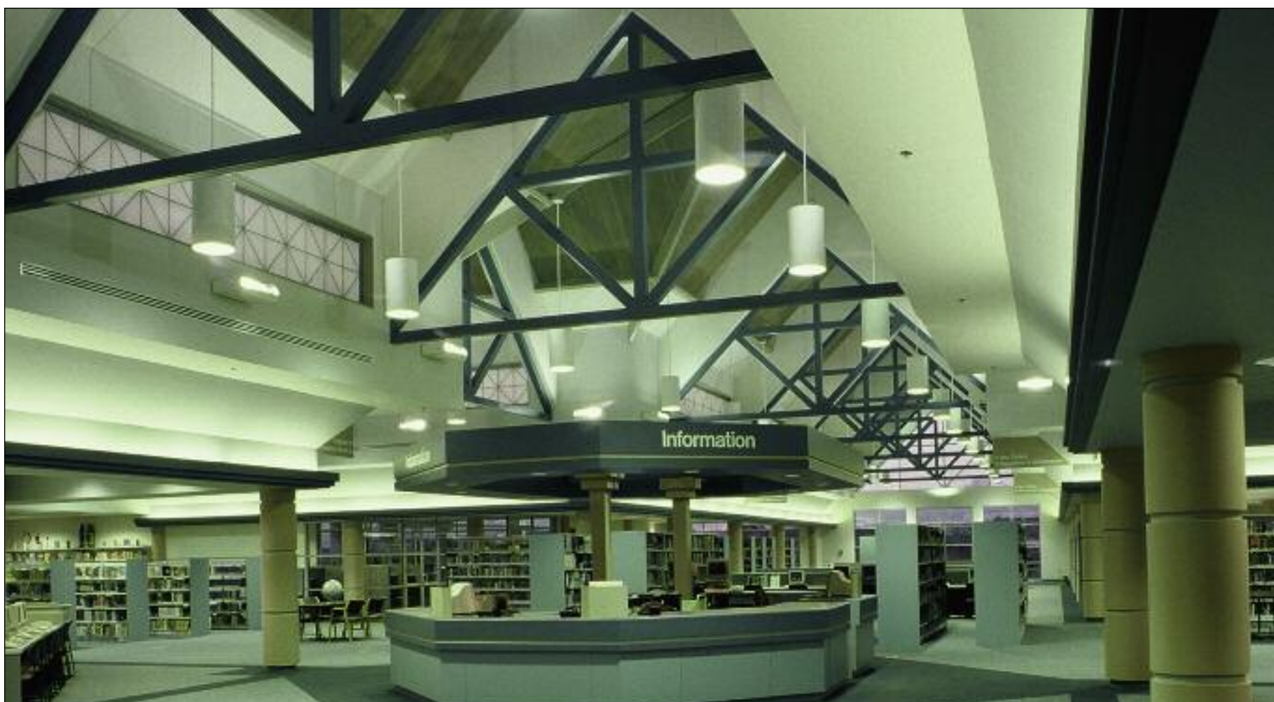
Centreville Library Interior