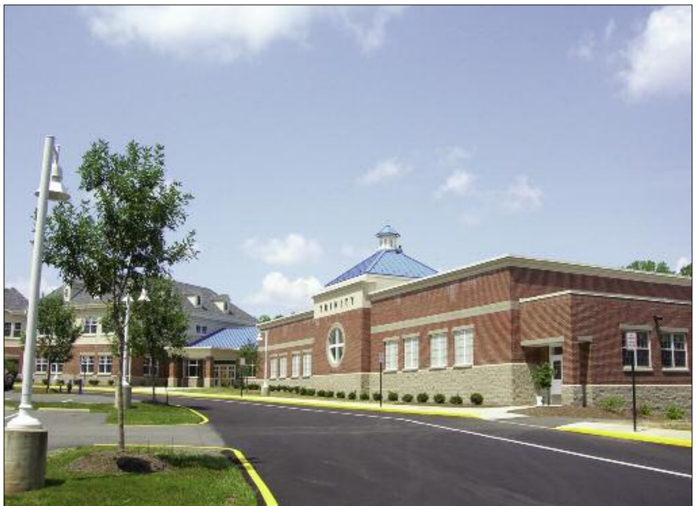
Trinity Christian School