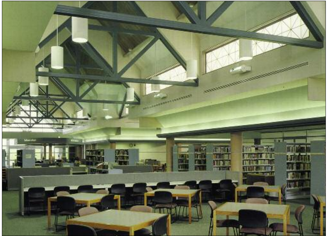
Centreville Library Interior