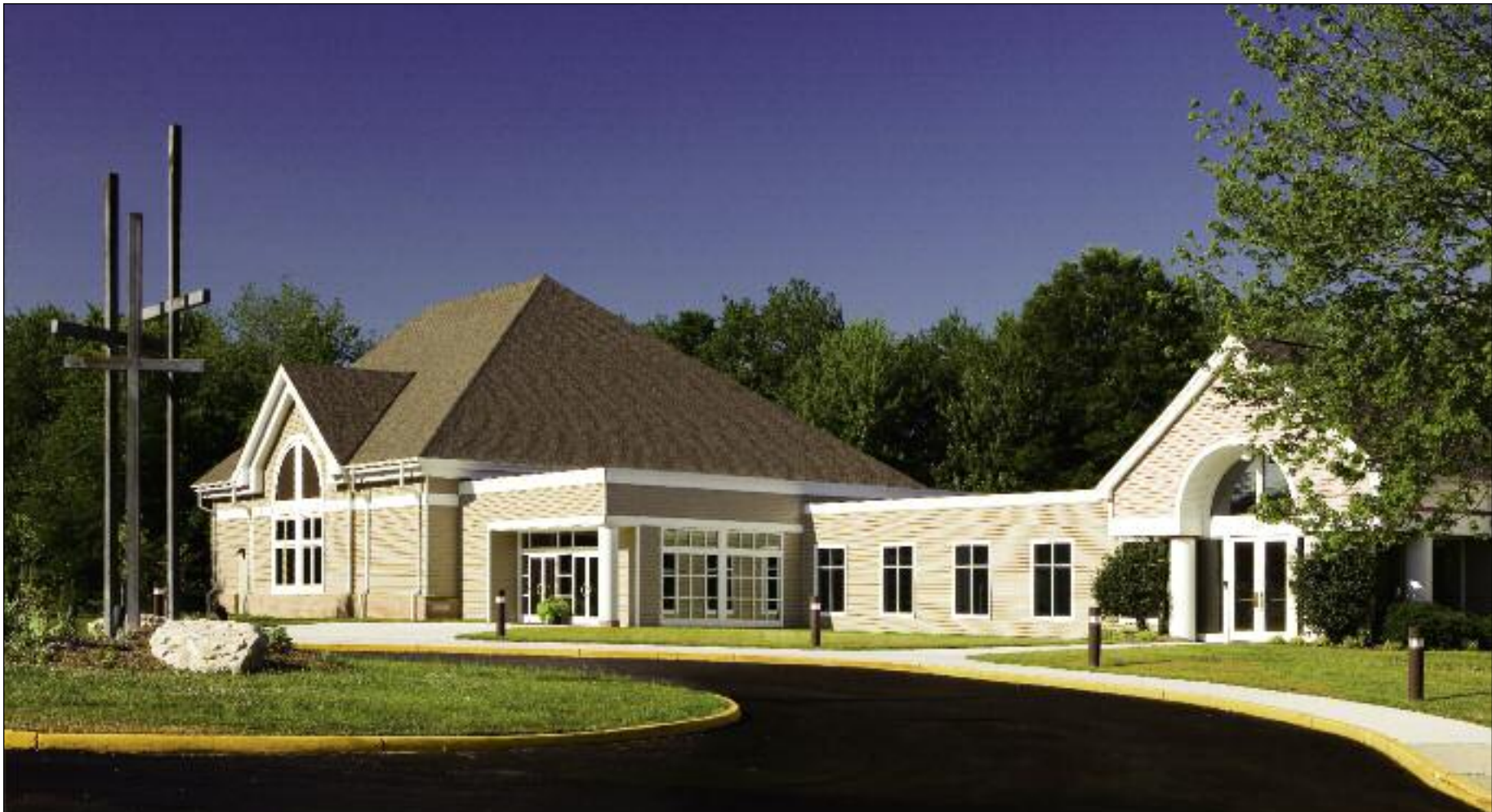
Living Savior Lutheran Church