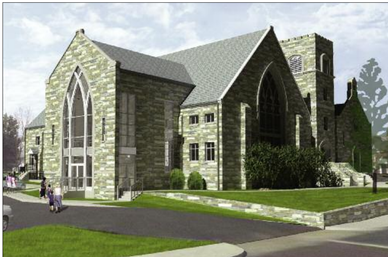
Arlington Church of Christ

Over the years, Helbing Lipp Recny Architects has become one