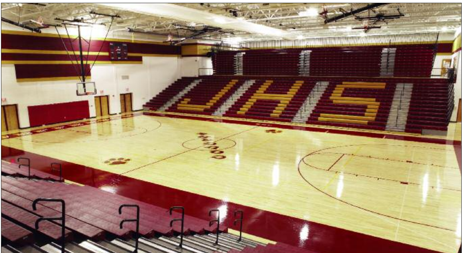
Jefferson High School Gymnasium