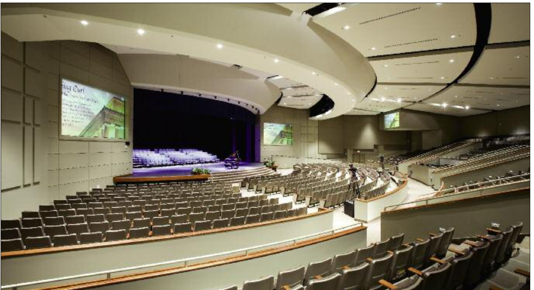
Centreville Baptist Church — Credit: Dan Cunningham