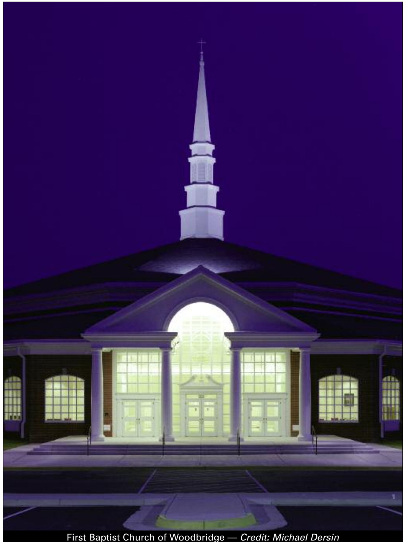
First Baptist Church of Woodbridge