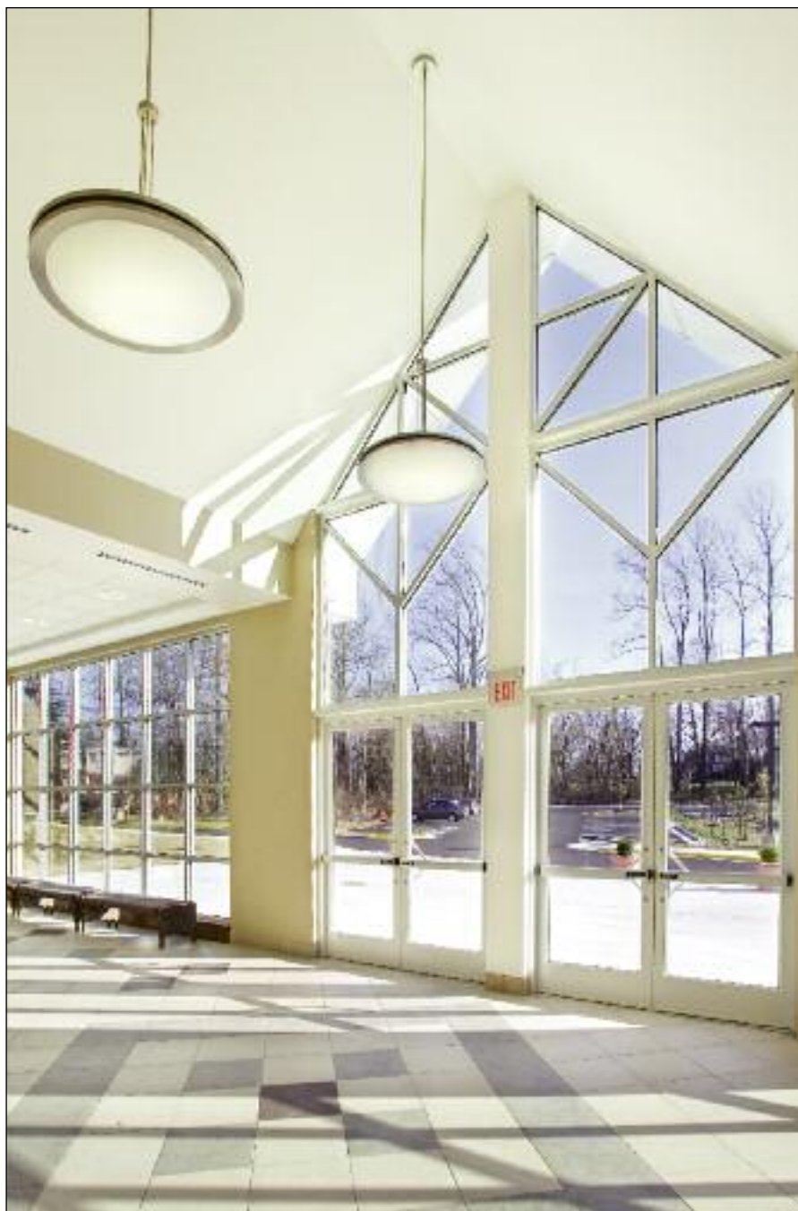
Knollwood Community Church