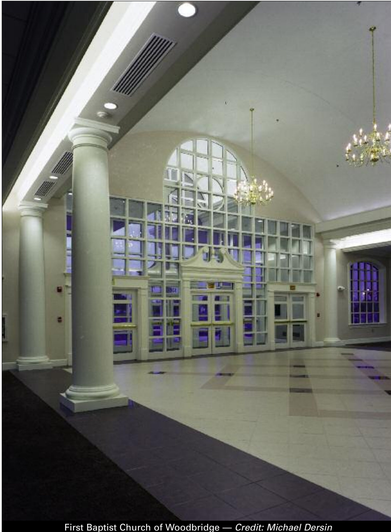
First Baptist Church of Woodbridge