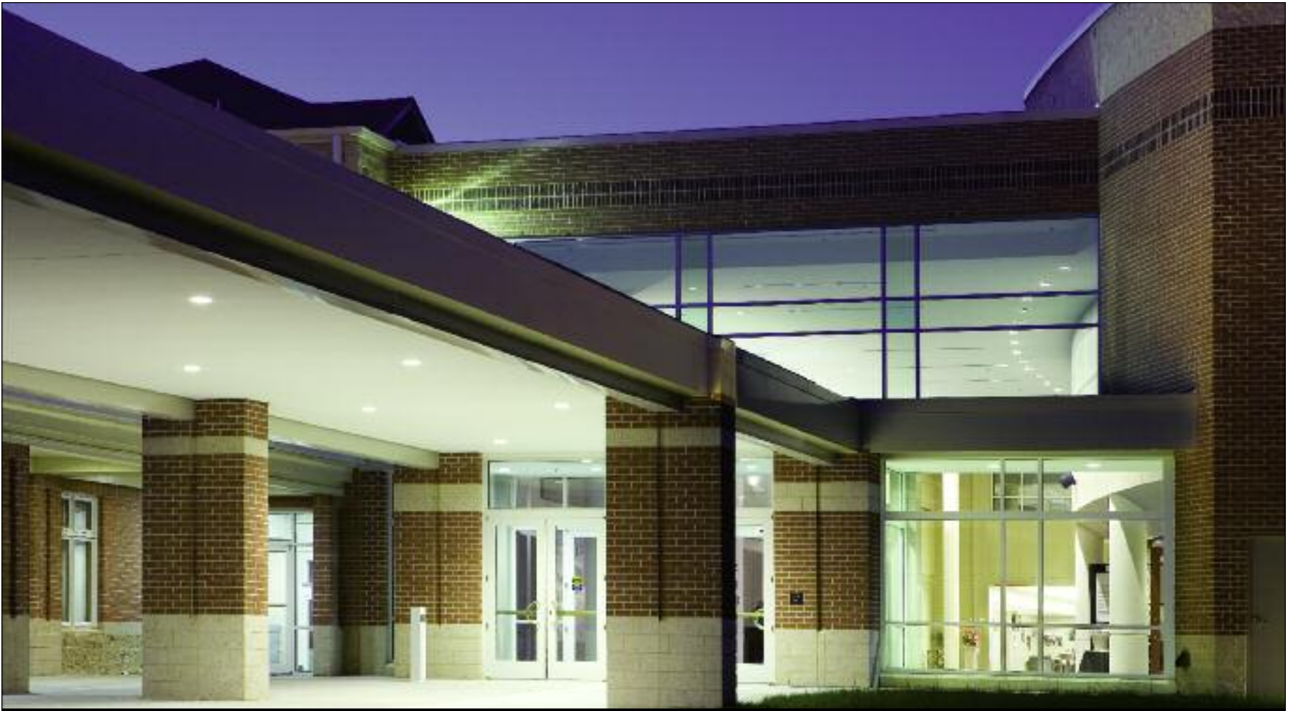
Centreville Baptist Church