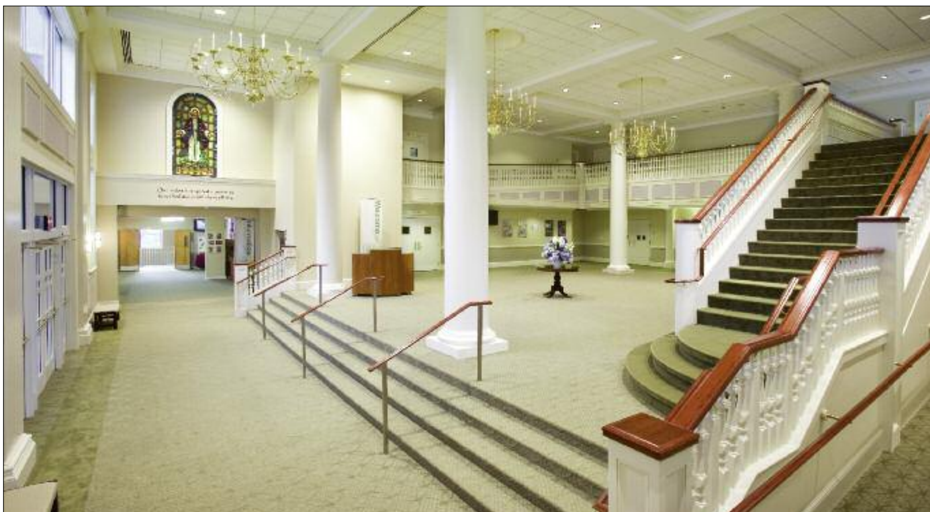
Cherrydale Baptist Church