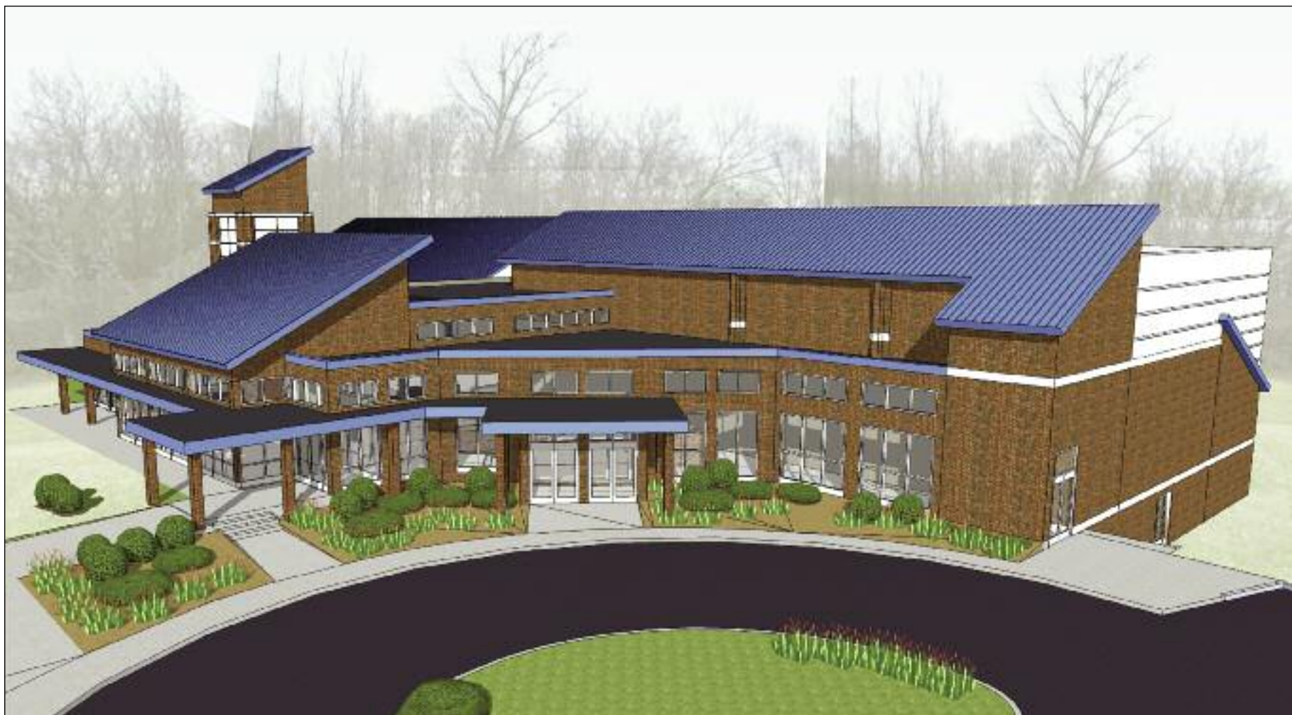
Capital Community Church — Credit: Helbing Lipp Recny Architects