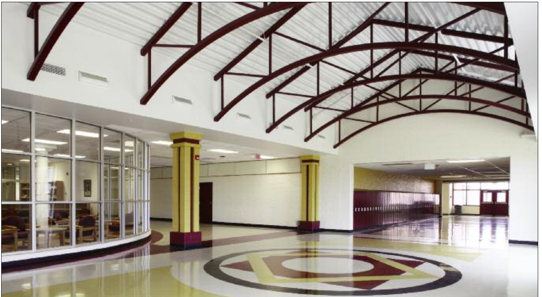
Jefferson High School Common Area