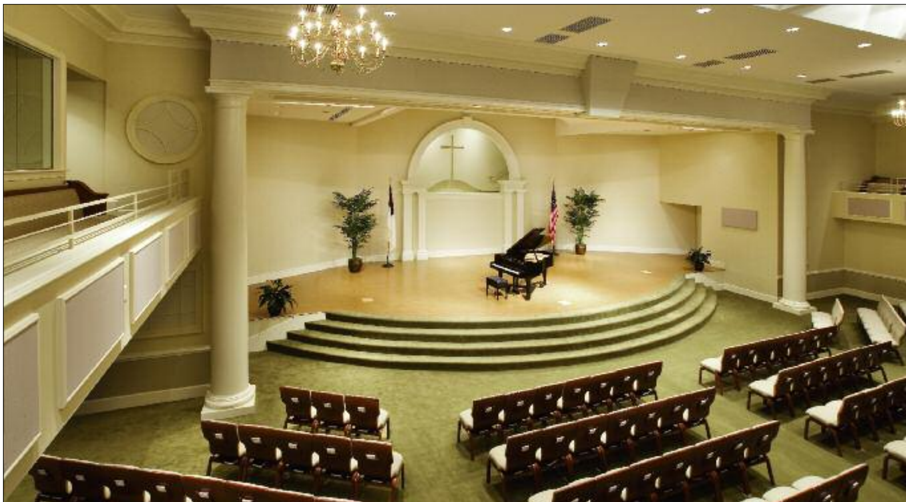
Cherrydale Baptist Church