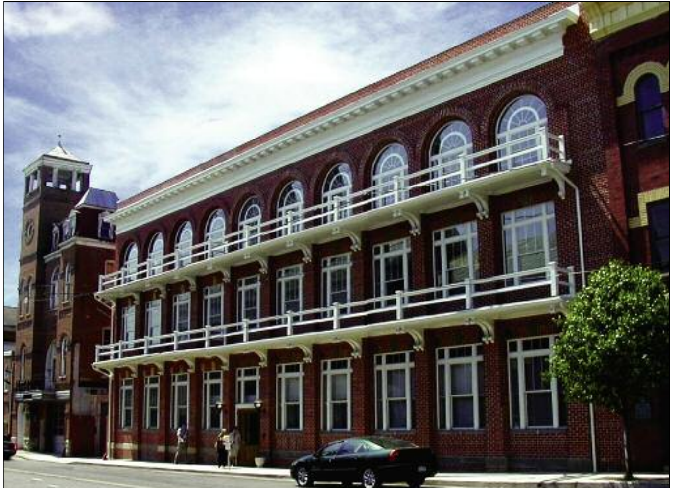
Jefferson County Judicial Building