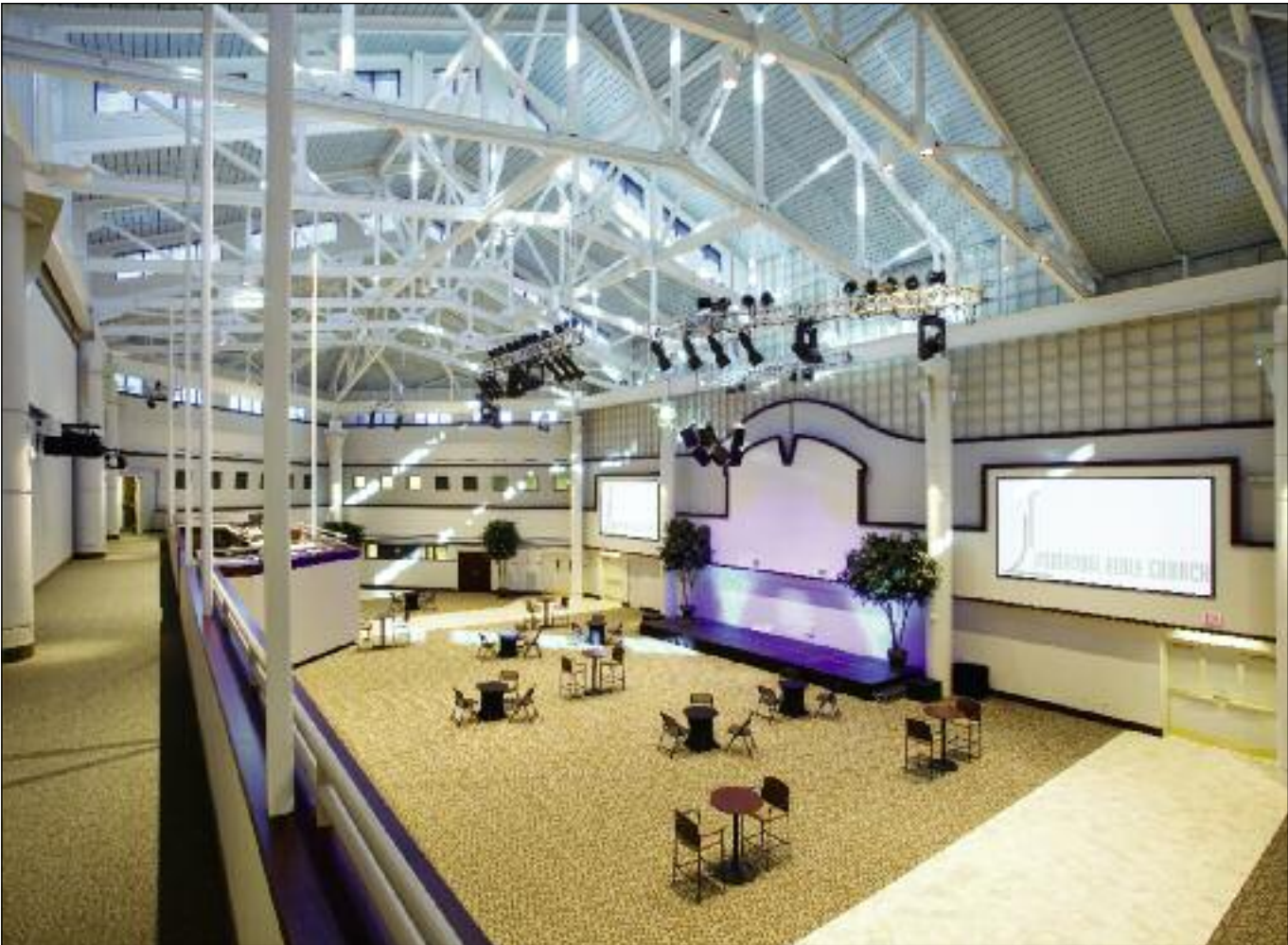
Immanuel Bible Church