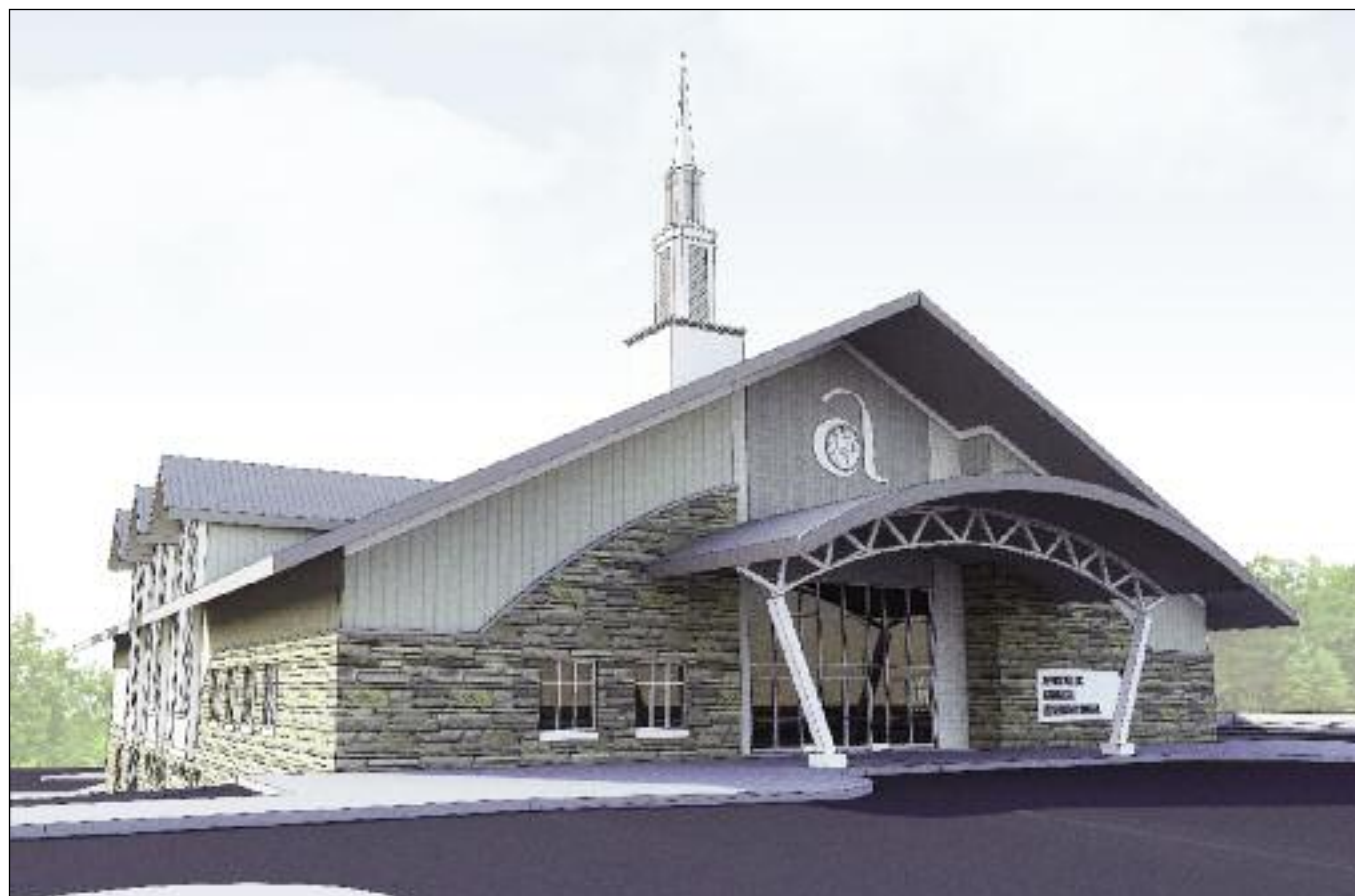
New Sanctuary — Credit: Helbing Lipp Recny Architects