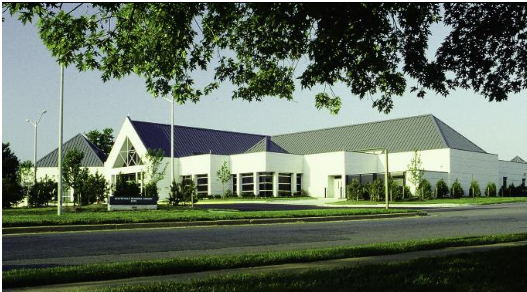
Centreville Library