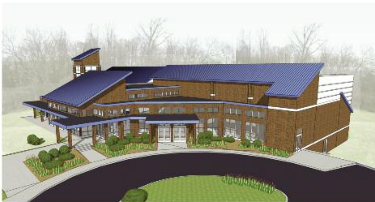
CAPITAL COMMUNITY CHURCH — ASHBURN, VA

43676 Trade Center Place, Ste. 150, Sterling, VA 20166 (703)742-8900 • Fax: (703)742-6896 • www.sullyconstruction.com